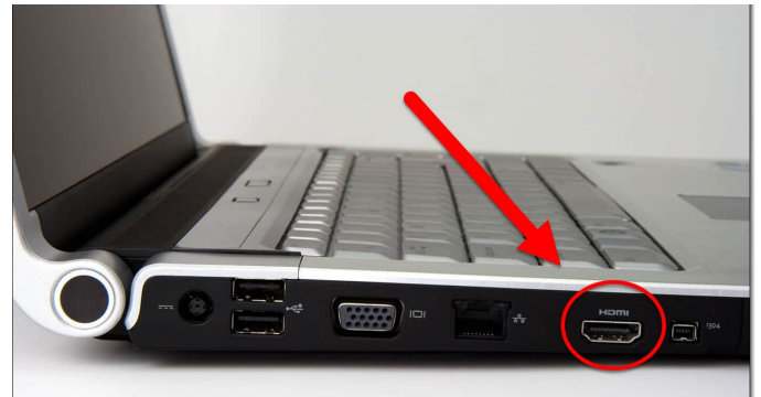
HDMI on Laptop