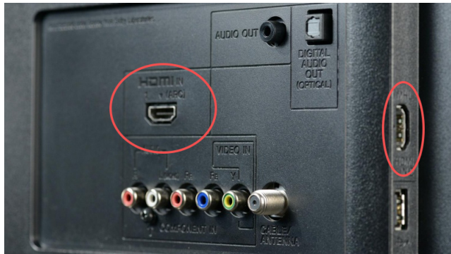
HDMI on TV

It will look something like the following: